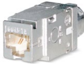
Module PS-GG45 7 A 1000 MHz shielded