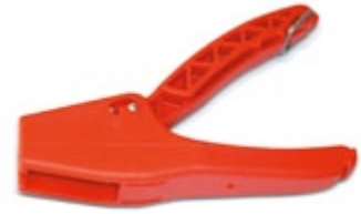
Termination tool for GG45