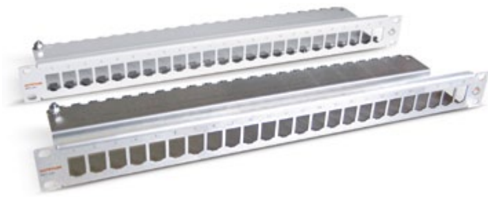
Patch panel MPS 24x, shielded