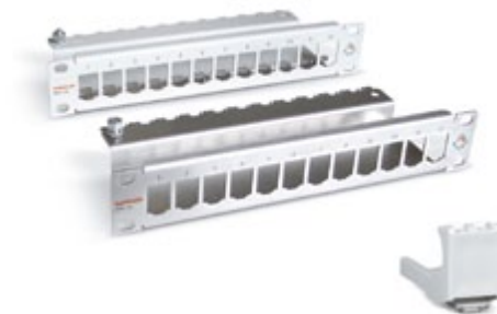
Patch panel MPS 12x, shielded