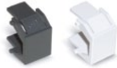
Blank covers, black and white