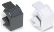
Blank covers, black and white